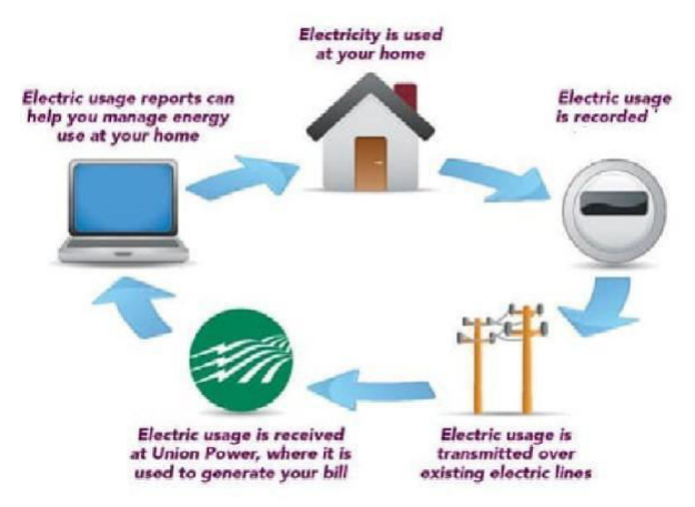
Fig 5:Bill Generating System

The electricity consumed at our home will be monitored equipmentwise which is in the form of current and voltage. The analysed data will be recorded and sent to arduino and it will further calculate the data and send to user's device which can be laptop or android phone or also it can be seen on website.